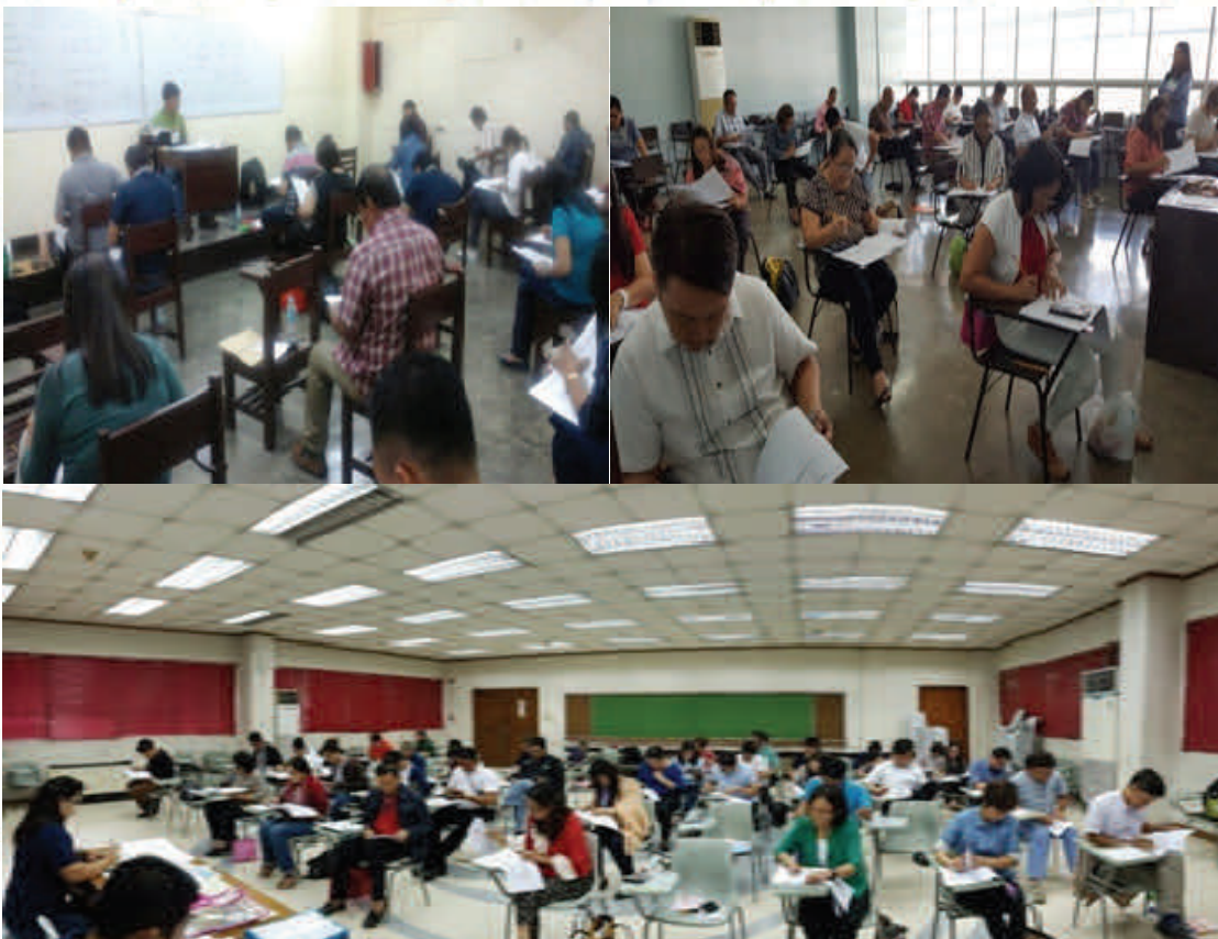
(Upper left to right: San Pedro College, Davao City and University of Cebu, Cebu City, Lower picture: University of the Philippines, Quezon City)

Of the 222 examinees, 149 (67%) took the exam in Quezon City, 46 (21%) in Cebu City, and 27 (12%) in Davao City.