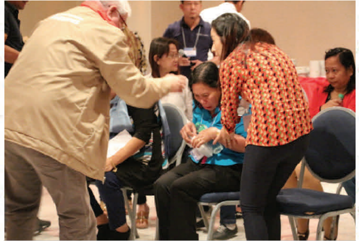
The participants were deep into their characters during one of the workshops of Project Paglaum.

The Paglaum training workshop is a capacity-building program which aims to develop the skills and competencies in providing psychosocial support to survivors of disasters and in post emergency situations. The training is named after the Visayan and Bicol word "Paglaum", which means hope. Graduates of the training are called "Hope Bearers" to signify their mission of bringing back hope to individuals and restoring their hope and ability to live life to the fullest of their capacities. 🌐